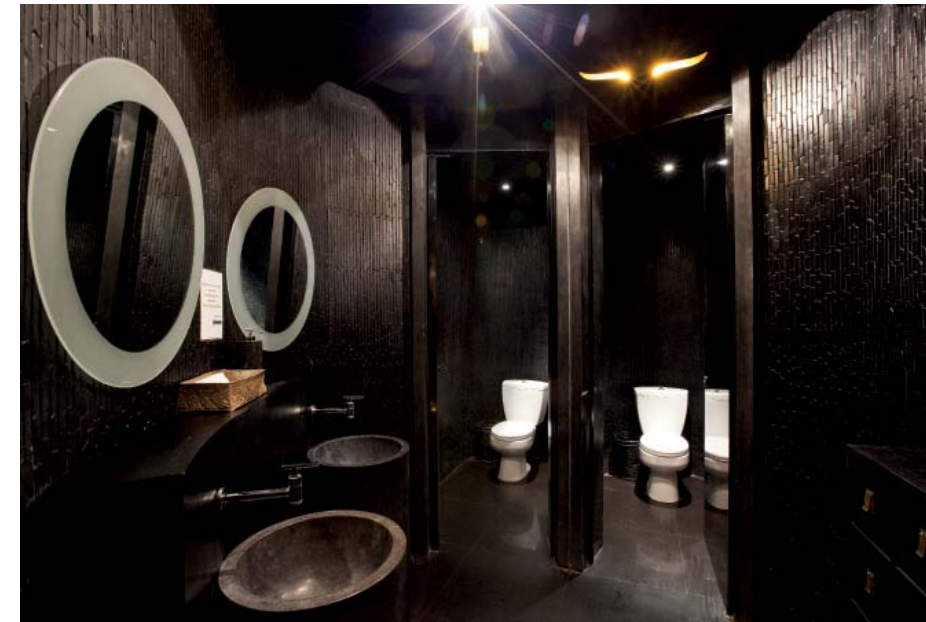
A SEMINYAK STATE OF MIND CLOCKWISE FROM LEFT — Stylish restrooms appeal to the discerning upmarket patron — Regular art exhibitions are held at the venue — A walkway with the New York skyline depicted as an accent on the wall — Communal seating arrangements to aid in social engagement