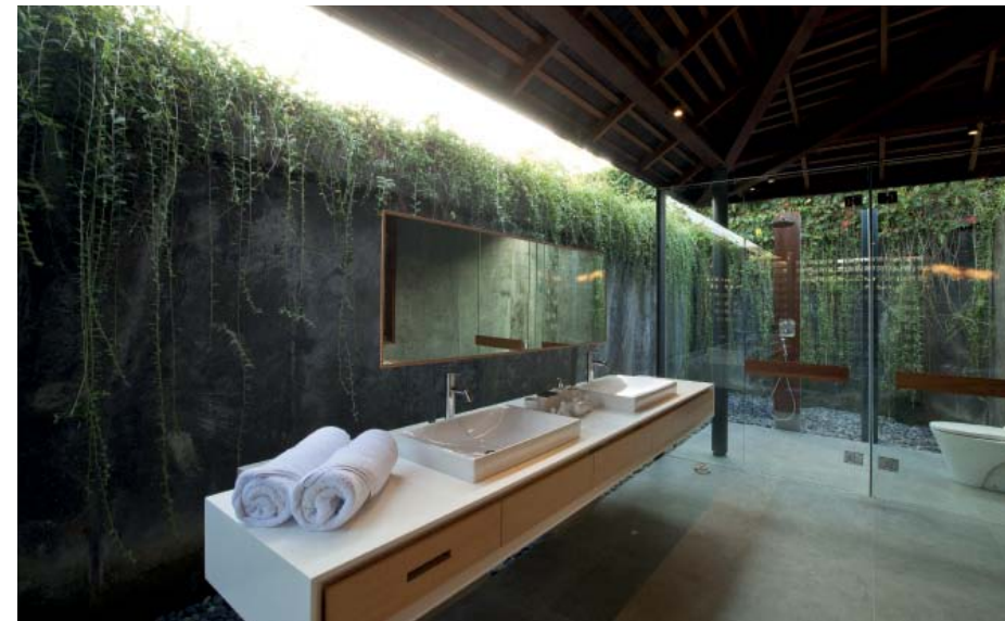
THE WAYAN BALIK PHENOMENON CLOCKWISE FROM LEFT — The bathroom amenities seems to be floating in the glass walled en-suite bathrooms — Open plan living with the pool, deck, lounge and kitchen outside the enclosed bedrooms — Paved walkways in the landscape guide visitors through the resort and onto each private villa — All the rooms are air conditioned, spacious and furnished with built-in and secured light wood furniture

can enjoy relaxed family time in simplistic safe surroundings. The need for this resort actually resulted as singles and party animals can stay at IZE, families can discover natural treasures at The Menjangan, newlyweds can have a honeymoon at The Bale, couples can experience the bliss of The Amala and now finally catering to the entire family, clientele can return to the trusting care and impeccable service levels they are accustomed to when they stay at the "Wayan Balik" of Lifestyle Retreats - The Santai.