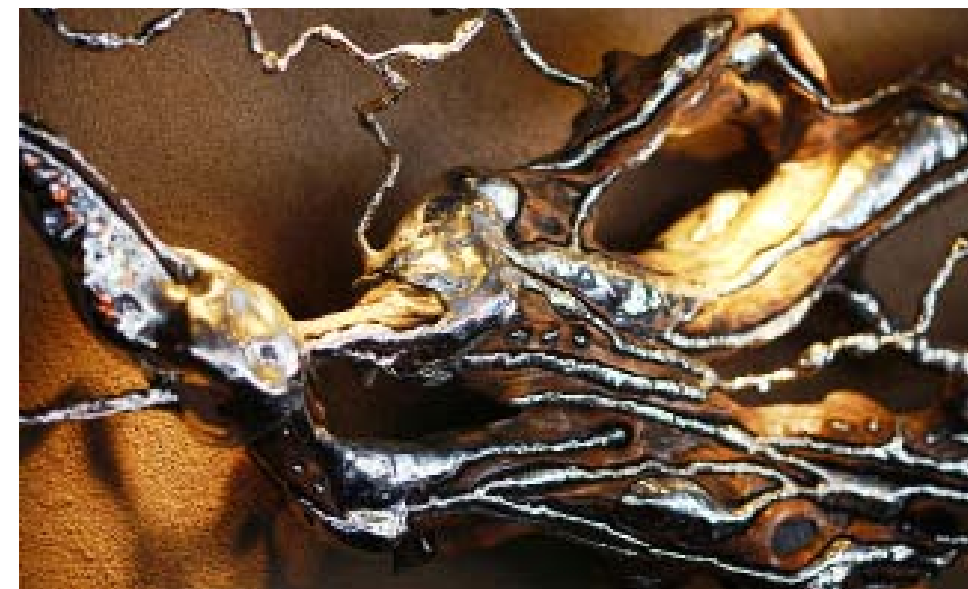
THE SURREAL BALI CLOCKWISE FROM TOP

— The well-designed spacious reception area