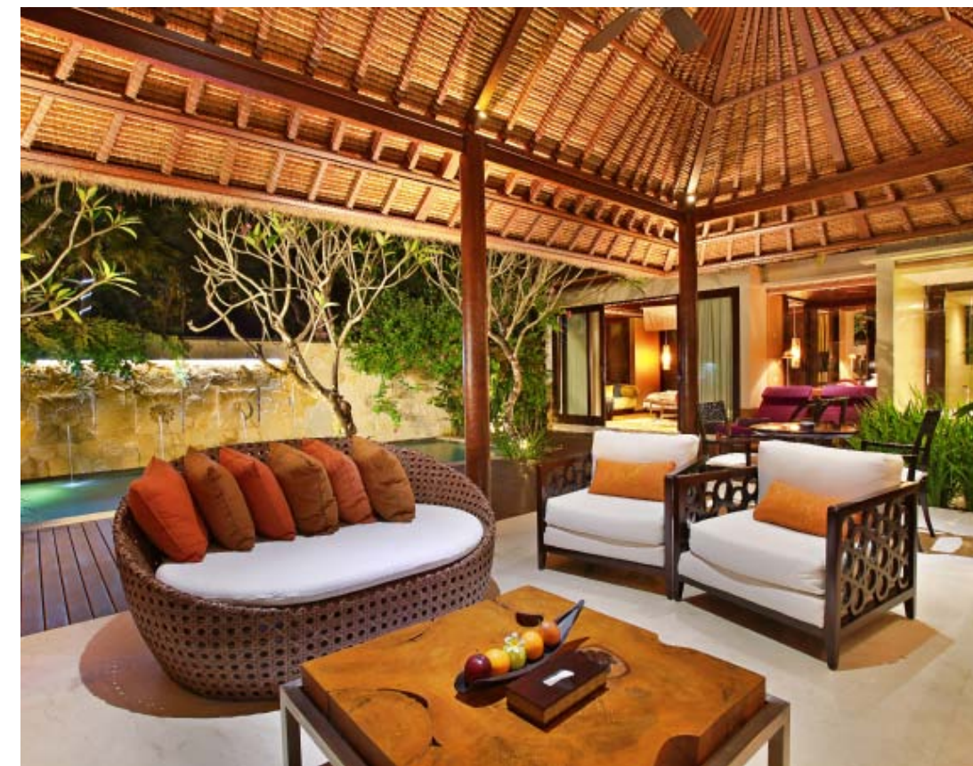
THE SURREAL BALI CLOCKWISE FROM LEFT — Open plan living area — The marbled bathrooms with skylights — Each villa has its own private Balinese inspired entrance door — Luxury meets Balinese design inside the villa's bedrooms

designed to provide ultimate luxury. Occupying the area of 200 – 300 sqm, each villa is built with high quality local parquet flooring, rattan chairs, wooden bed and marble bathroom. Made by highly-acclaimed craftsmanship and artistry the villas, each with their own pool, are named after flowers such as Bougainvillea, Rose, or the only three bedroom villa, Orchid.