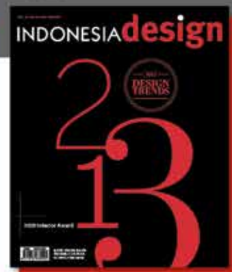
2013 Design Trends