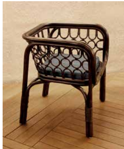
FURNITURE CLOCKWISE FROM LEFT — Uncle Ted Dark chair — Melanie Table — Jiru Barstool