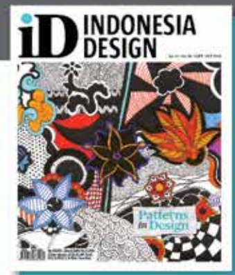
Patterns in Design