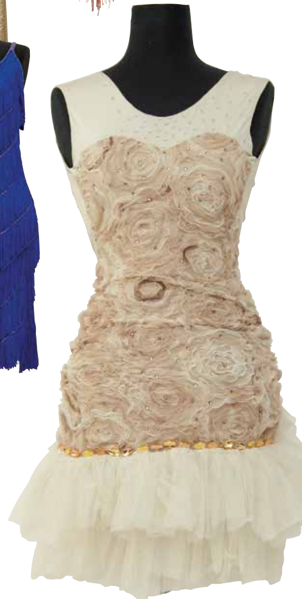
COUTURE CLOCKWISE FROM RIGHT — "Blossom Cocktail" a 1920's inspired fitted floral beige garment with added flair — "Blue Charleston" is a body hugging dress to show your curves with tassels for playful movement — "Goldy Dress" a simple yet elegant and luxurious Roman inspired dress — "Dazzling Fringe" this red vintage beaded garment has a transparent top and open back