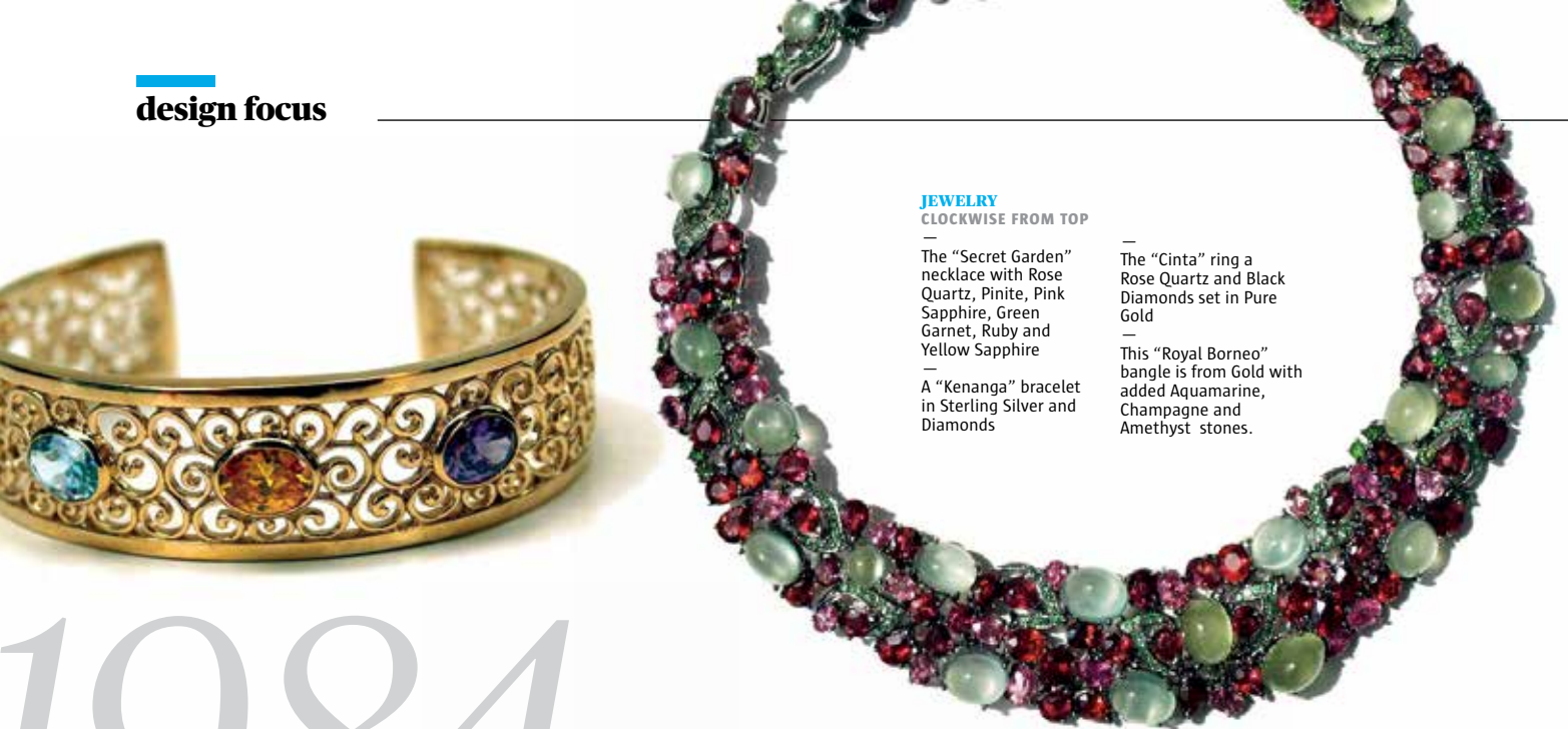
JEWELRY CLOCKWISE FROM TOP

— The “Secret Garden” necklace with Rose Quartz, Pinite, Pink Sapphire, Green Garnet, Ruby and Yellow Sapphire