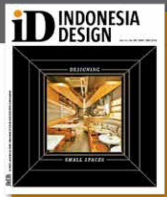
Designing Small Spaces