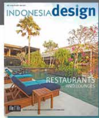
Restaurants and Lounges