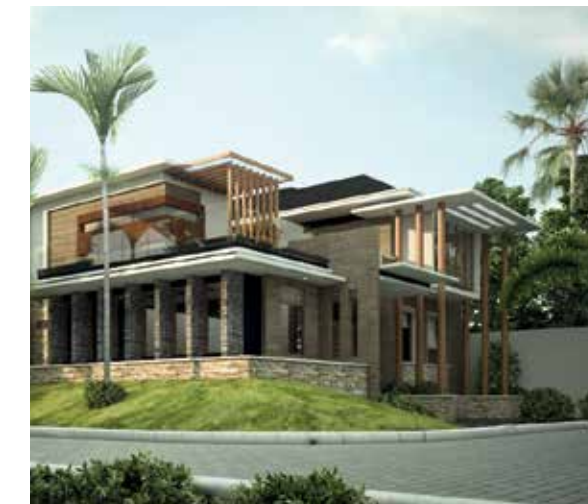
ARCHITECTURE CLOCKWISE FROM LEFT