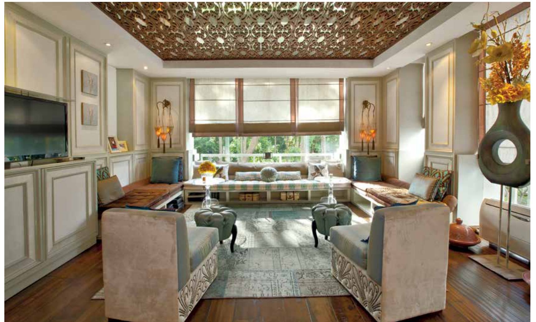
FEMME FATALE CLOCKWISE FROM FAR LEFT — A custom made glass shelved console for the dining area — The entrance from the private elevator with a fainting couch and delicate decor — The main seating room with view of the outside play area — Carpeted television and activity room with a round play couch

It often happens when visiting a beautiful home